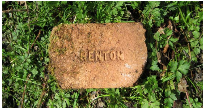
Brick produced at the Denny-Renton Clay & Coal Co. in Taylor, WA.