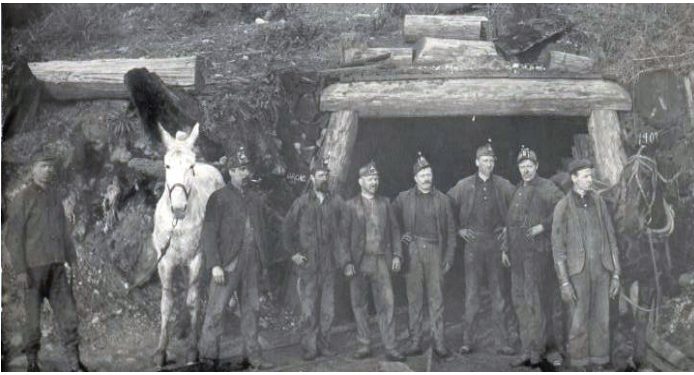
Entrance of the coal mine at Taylor, WA, 1903.