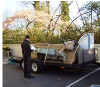
Preparing the Roxy sign for transport to Seattle.